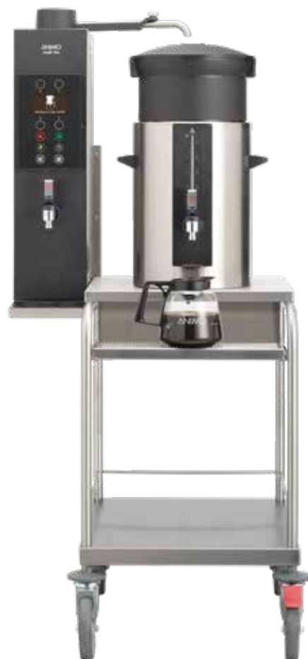
+ Type - S (Type - C is suitable for 2 containers)