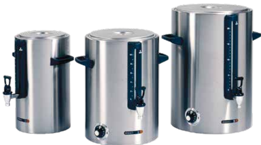
+ WKT-D - series