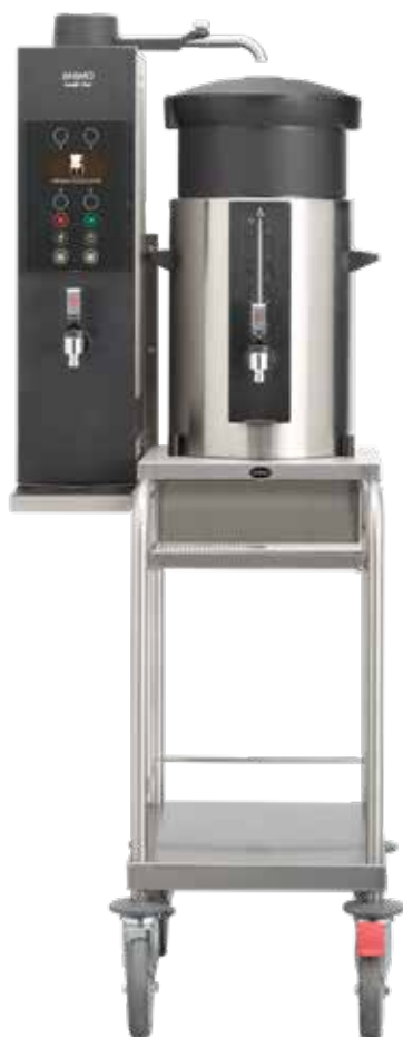
+ Type - J