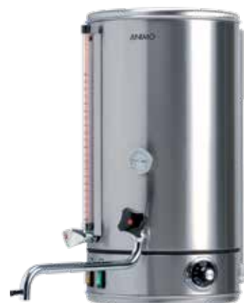
+ WKI - series