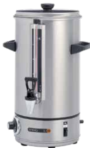
+ WKT - series