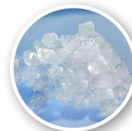
FM-12oKE-HCN Ice: Nugget