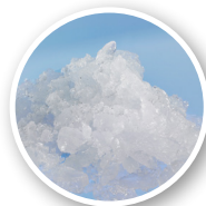
FM-12oKE-HC Ice: Flake